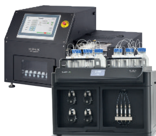
Sample preparation for LSC