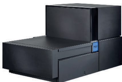
Hidex 600 SL