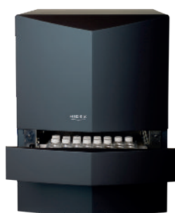
Hidex 300 SL

Hidex has served the liquid scintillation counting community for three decades. In recent years, the global market has been missing a true ultra low level LSC that would meet the most demanding needs. Applications in hydrogeology when mapping the global clean water resources, detection of biogenic carbon content in materials or measuring trace concentrations of alpha and beta isotopes in soil, food and drinking water require absolute accuracy and precision. True to our heritage of constant innovation we have developed our next state of the art counter to meet these requirements.